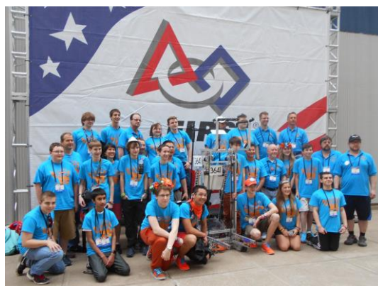
Pictured above are the Flying Toasters at Worlds

In addition, to the FRC high school level, there were FTC and FLL teams in a different building along with an Innovation Faire.